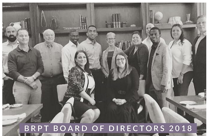
BRPT BOARD OF DIRECTORS 2018